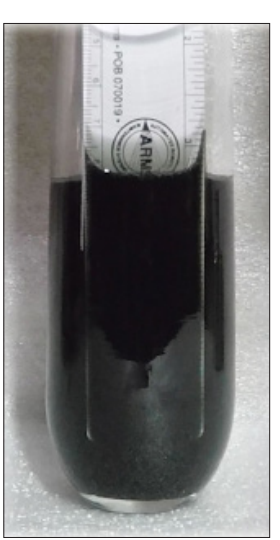
BRAND X ACTUATOR AFTER <10,000 CYCLES